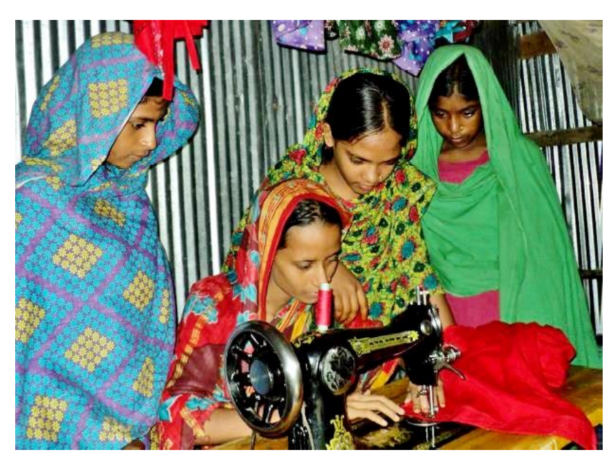
Sultana teaching some young women to sew

Tk2,000 and purchased a stock of ready-made clothes to sell to her customers, bringing in an extra Tk700 to Tk900 per month. She then took a loan of Tk5,000 from BRAC to buy cloth for making into clothes. She also became trainer of tailoring and has taught 15 local women and girls, and initially charging each of them Tk1,500 for 30 days of training and later Tk2,000. Her income from tailoring increased to Tk10,000 to Tk15,000 per month, and she took a second loan of Tk10,000 from BRAC to purchase a cow. CDSP IV also supplied her with a hygienic latrine, and training on disaster management and on legal and human rights.